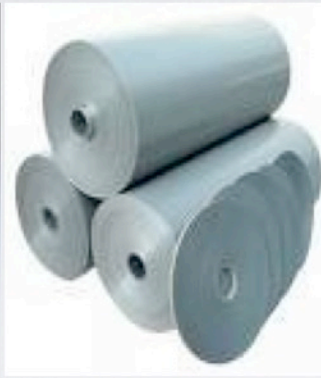
Anode and Cathode Foils