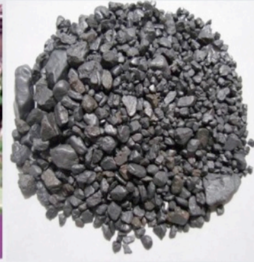
Tantalum Ore, Powder & Wire