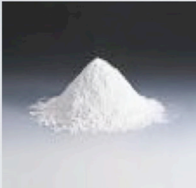
Ceramic Dielectric Materials